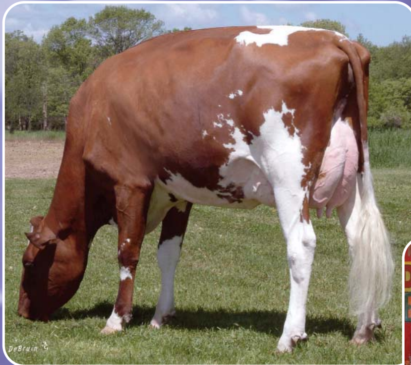
UNCLE SAM DAUGHTER

Rubens x Karmel (92) x Jubilant (86) • Stud Code: 151HO5633 • aAa: 3 Open, 1 Dairy, 2 Tall • Calving Ease: 13% MILK +643 LB. • FAT 0.09% 45 LB. • PROTEIN 0.09% 40 LB. • RELIABILITY 84% • TYPE +1.57 • UDC +2.27 • F&L +0.01 • TPI™ +1459 (MACE)